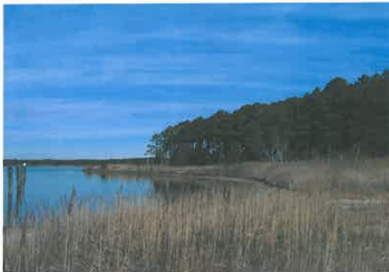
Point Lookout State Park, St. Mary's County