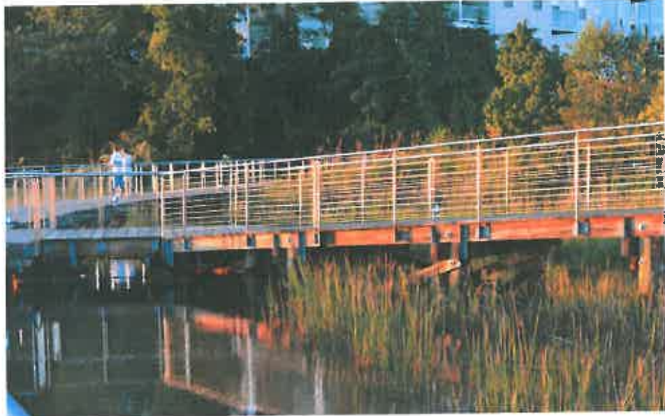
Port of Leonardtown, St. Mary's County

As interpretive programs are developed and audiences are attracted, it will be critical to develop feedback and evaluation mechanisms so that programs and events can be tailored to the interests of the specific audiences that are drawn to the Trails and Byway. The four programs would clearly benefit from a joint effort to study audiences and impacts