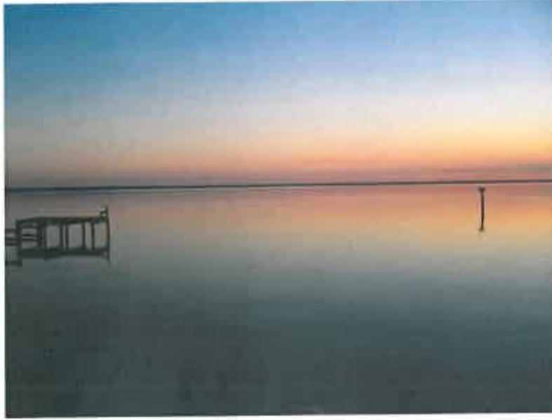
Cobb Island, Charles County

three-year struggle that established a foundation for the United States' economic independence and military strength.