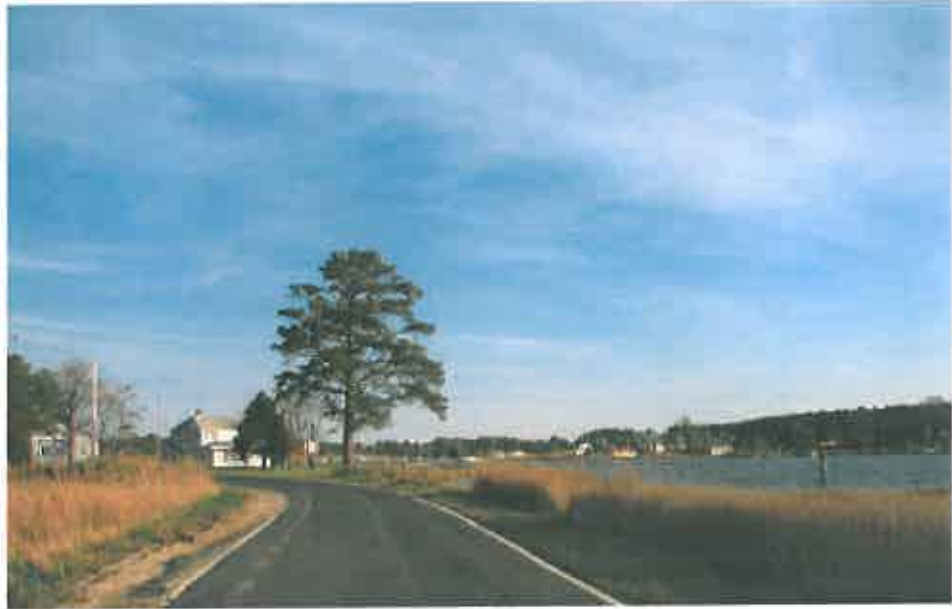
Island Creek, St. George's Island, St. Mary's County

The characteristics of the landscape created opportunities for human occupation and cultural development. The ways that Native Americans used, managed, and conceived of the landscape were vastly different from those of the English colonists.