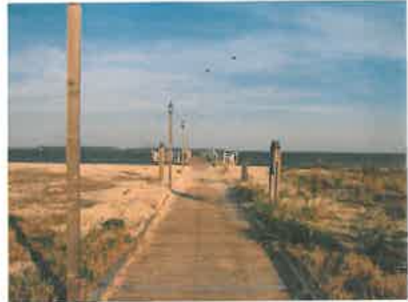
Piney Point, St. George’s Island, St. Mary’s County

Again, three of the four programs easily embrace this theme, although it can be said that STSP focuses