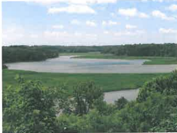
Friendship Park, Nanjemoy Peninsula, Charles County