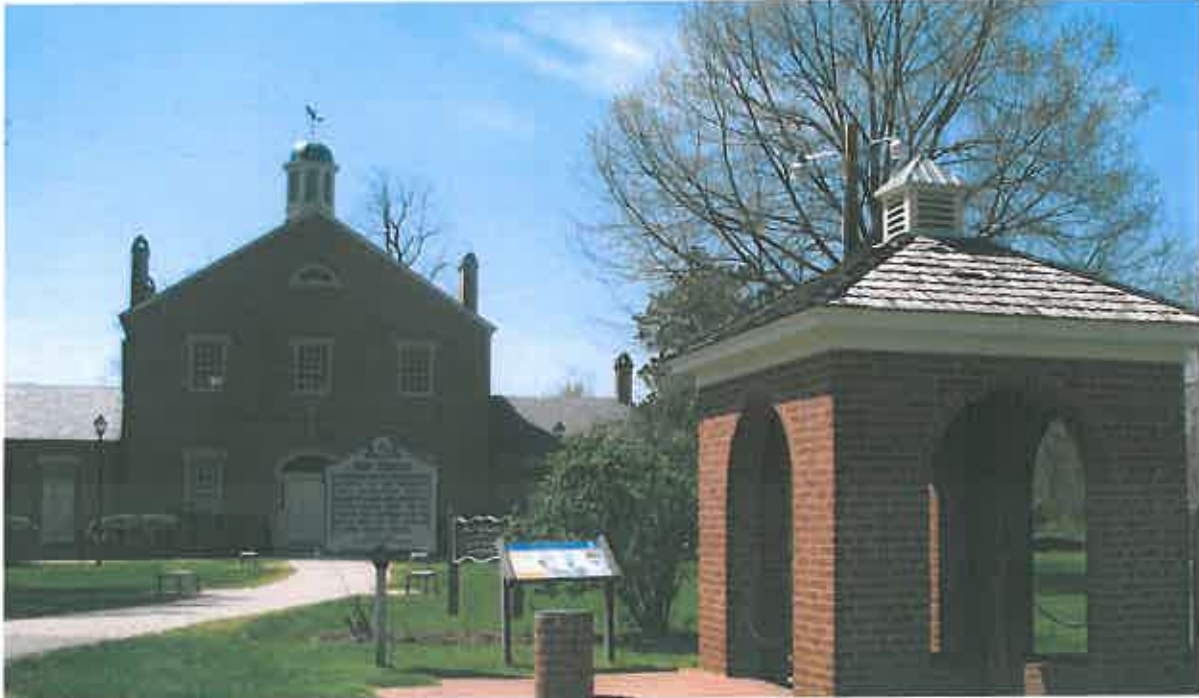
Port Tobacco Historic Village, Charles County

Tobacco led to a wholly new economic system, yet now it has virtually disappeared in Southern Maryland; imperialism, another driving force behind Maryland's settlement by Europeans, waxed and waned as well. STSP examines one of the consequences of that imperialism, commemorating a major aftershock in the re-ordering of that society around another profound social concept, democracy. Capitalism, the industrial revolution, the scientific revolution, and many other economic, technical, and social changes rippled through the landscape and society here. The stories of how people adapted in this region remain relevant to our lives today. At the other end of the time scale, POHE interprets "Restoration, Recreation, and Sustainability" as a primary theme, aimed at modern audiences and relevant to modern lives. As our society continues to cope with the ecological changes that continue to manifest themselves in the Chesapeake, in urbanism, and in technological and economic changes, stories of change, adaptation, and resilience offer intriguing ways to illuminate the preceding three themes.