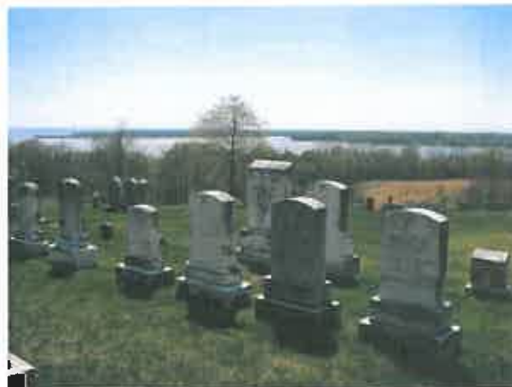
St. Ignatius Catholic Church, Chapel Point, Charles County

Substantial and sophisticated societies of native peoples existed in the Chesapeake region centuries before Smith arrived and although their communities were disrupted and some were ultimately displaced by European colonization, many descendant tribes