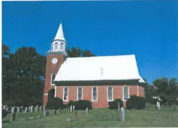
Christ Episcopal Church, Chaptico, St. Mary's County