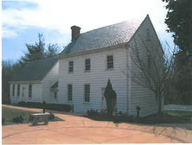
Mount Carmel Monastery, La Plata area, Charles County

Interpretive Sites are key interpretive locations that are publicly accessible and which can present exhibits and programs related to themes in this Common Interpretive Strategy. Most Interpretive Sites will be self-guided, though some sites have limited hours of operation and are available for visits by appointment. While some sites have existing exhibits presenting the history of their locations, others currently have no interpretation or interpretation focusing on natural resources without reference to related historical themes. Partnering relationships with the owners and managing entities of all the sites must be developed (and in many cases have been) to support the existing goals and missions of the sites and their organizations. Each of the Interpretive Sites has the potential to be enhanced through the use of interpretive media including interpretive waysides, customized exhibits, or audio-tour to help present stories related to