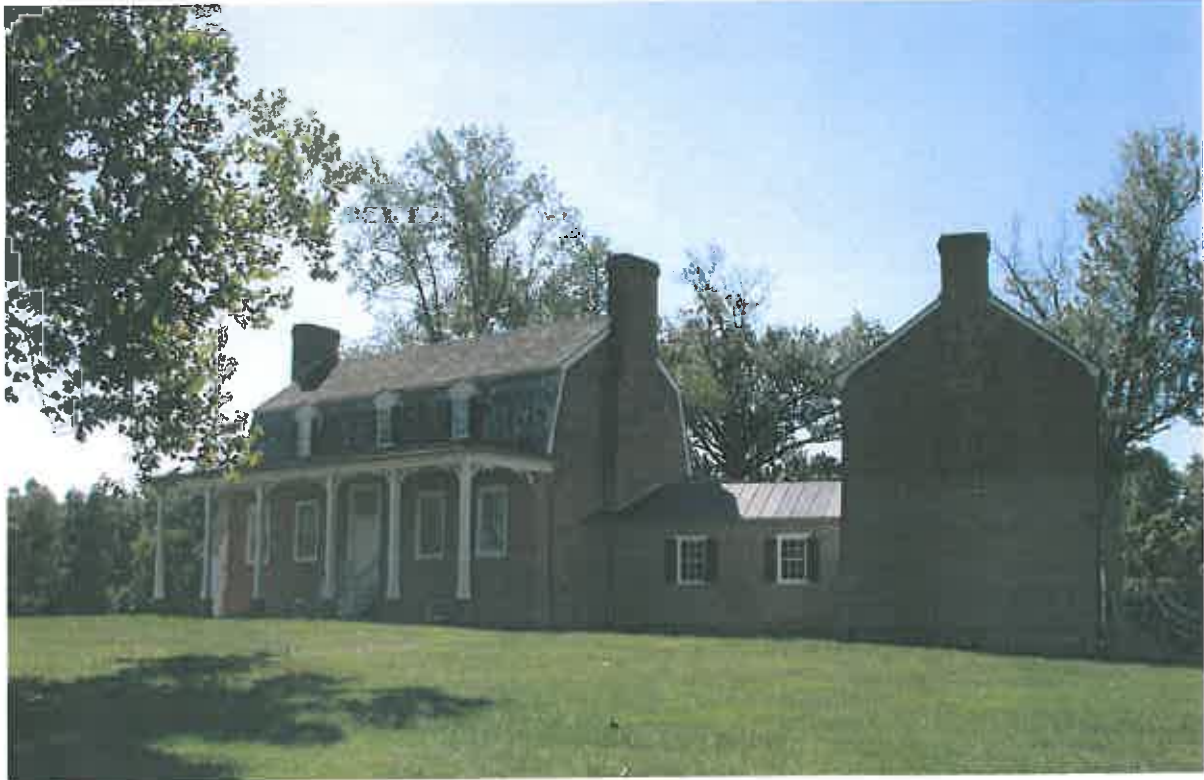
Thomas Stone National Historic Site, home of a signer of the Declaration of Independence, Charles County

This Common Interpretive Strategy addresses 35 possible interpretive sites or areas. This includes six “Anchor Sites” discussed in the following section: