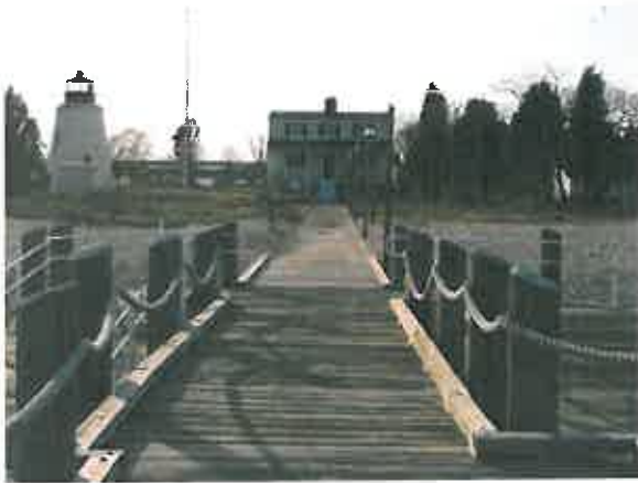
Piney Point Lighthouse, Museum and Historic Park, St. Mary's County