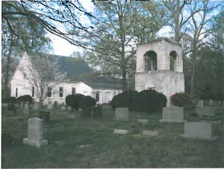
St. George's Protestant Episcopal Church, Valley Lee, St. Mary's County

The section on "Interpretive Sites" also includes many state and local public lands, St. Mary's College of Maryland, and one area of federal land: