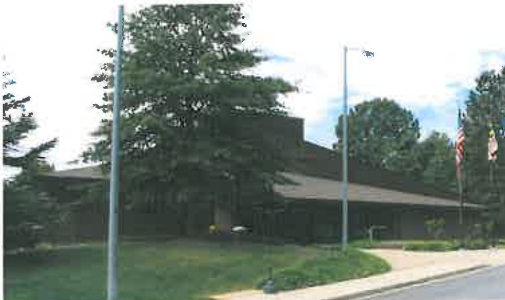
Maryland Welcome Center, Crain Memorial Highway at the Potomac River crossing, Charles County

Should a particular site or project require identification of a particular individual program’s sponsorship over and above the unified identity, accommodation should be possible by enlargement or otherwise setting forth the particular logo in question, together with special wording (e.g., “this project was sponsored chiefly by...”).