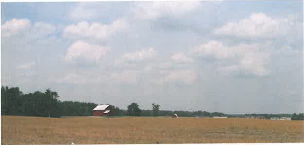
Farmland along the Religious Freedom National Scenic Byway, MD Route 234, St. Mary's County