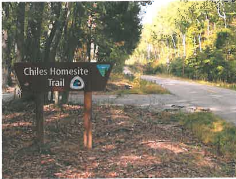
Chiles Homesite Trail, Douglas Point, Nanjemoy Peninsula, Charles County

Of all Colonial-era landscapes on the Atlantic Seaboard, St. Mary's and Charles Counties in Maryland, especially on their Potomac River shores, are among the least obscured by later layers of urbanization and modernization. 2034 will be the 400 th anniversary of Maryland's founding in St. Mary's County. While much change has occurred in this landscape over 38-plus decades, it is still possible to see and experience vestiges of its 17 th century organization – which arose from and was influenced by the indigenous cultural landscape, also possible to discern.