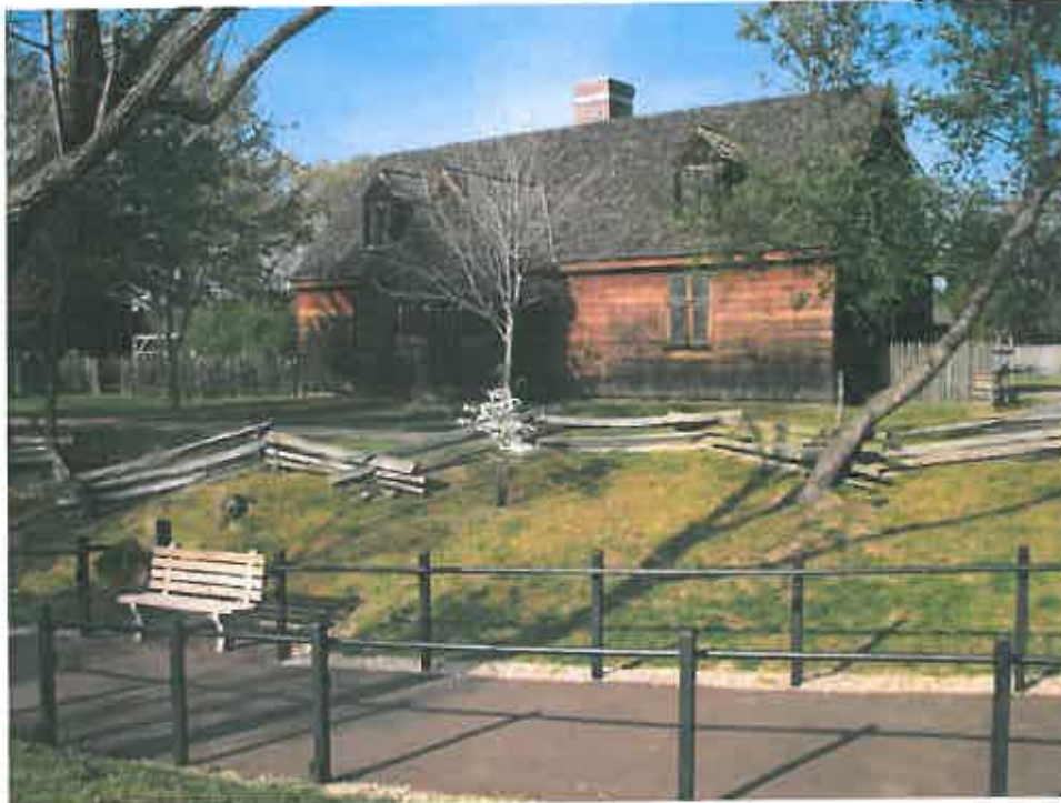
Historic St. Mary's City, St. Mary's County

among these. At least two early churches (one Catholic, one Protestant) are also active participants. The region's landscape, although much more heavily developed than further south along the Potomac, still exhibits rich traces of the same colonial heritage as found further south in Charles and St. Mary's Counties. Its southern end is anchored by the Accokeek Foundation's National Colonial Farm at Piscataway Park, another unit of the National Park System, which protects the view from Mount Vernon and a significant length of Potomac River shoreline – which includes a highly significant site of American Indian settlement that existed prior to European colonization. Before the alliance was formally organized, POHE supported creation of an on-road bicycle route following colonial-era routes in the area and leading to the Marshall Hall boat landing, operated in Piscataway Park by Charles County just south of the county line.