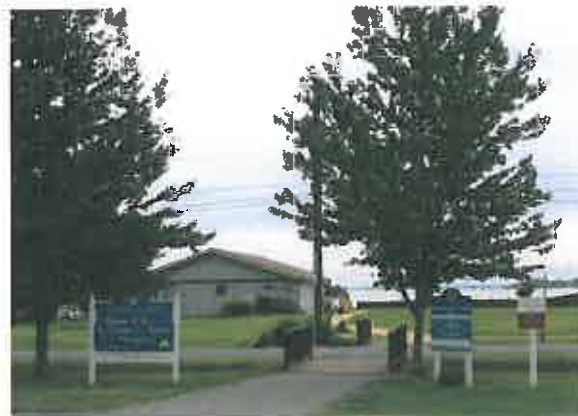
St. Clement's Island Museum, St. Mary's County

The National Park Service has no direct role in the general administration of the nation's National Scenic Byways (although in a few cases National Scenic Byways are administered by National Park System units). The RFNSB, however, is a partner and stakeholder in the three Trail programs, and has received NPS funding to support this plan. With formal and sustained cooperation among staff of the