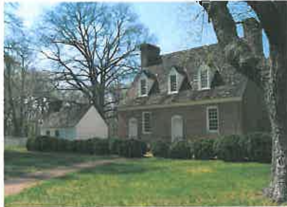
Smallwood's Retreat House, Smallwood State Park, Charles County

the park. They tell interpreters and designers what are the most important ideas or stories. They do not include everything we may wish to interpret, but they do cover those ideas that are critical to visitors' understanding of a park's significance." ( www.nps.gov/hfc/pdf/ip/interp-visitor-exper.pdf , p.13) This section insures that the reader understands each of the four programs in these terms ("park" being read as "trail" or "corridor" or "place," of course). Appendix A provides a more extensive comparison among the four programs, comparing purpose, significance statements, sub-themes, and intended audiences.