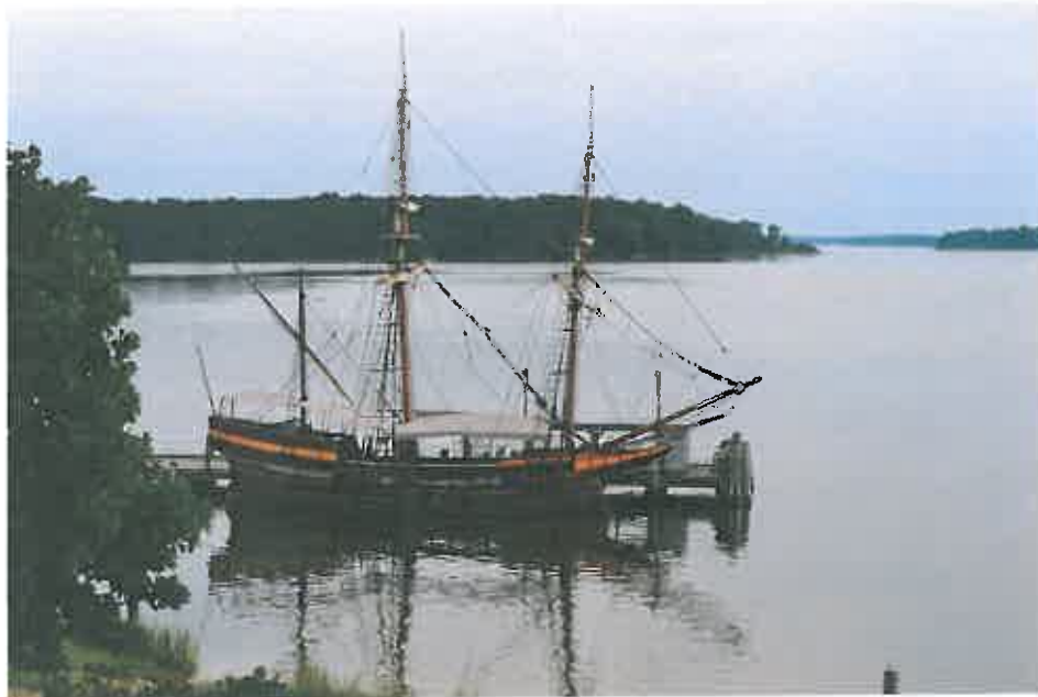
The 20 th -century reproduction of the 17 th -century Maryland Dove , at anchor at Historic St. Mary's City, St. Mary's County

The story – Captain John Smith most likely viewed the landscape while hugging the shoreline of the Potomac River on June 17, 1608. In Colonial times, it was originally acquired as part of a larger 4,000 acre tract in 1634.